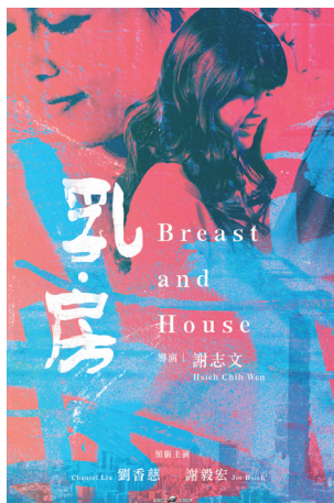
Breast and House