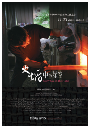
Starry Sky in the Flame