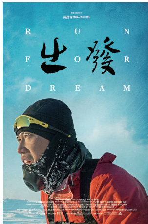
Run for Dream