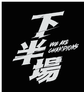
We Are Champions