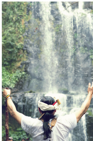
A Song Within Us