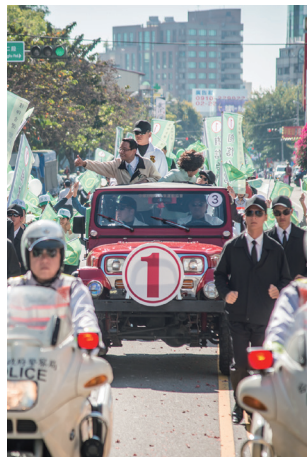
The Shooting of 319