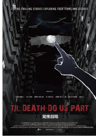
Til Death Do Us Part