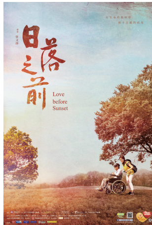
Love before Sunset