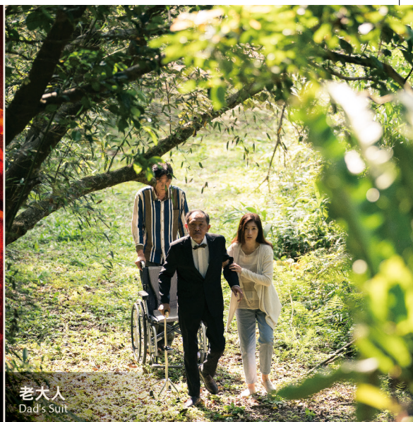
老大人 Dad's Suit