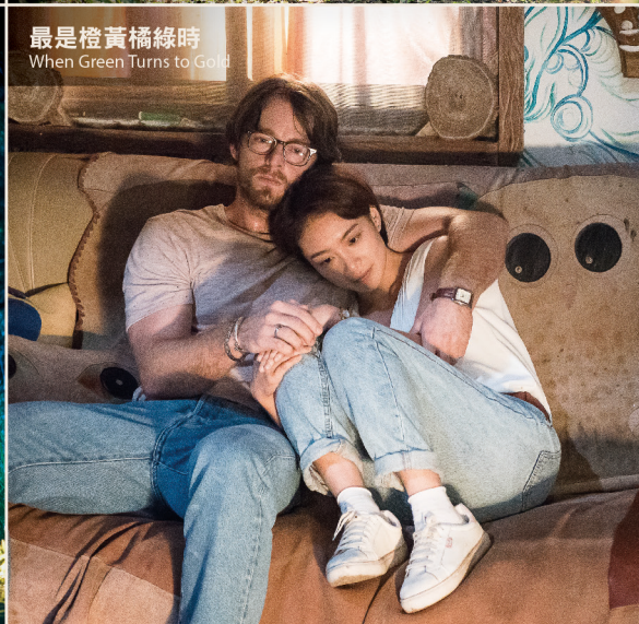
最是橙黃橘綠時 When Green Turns to Gold