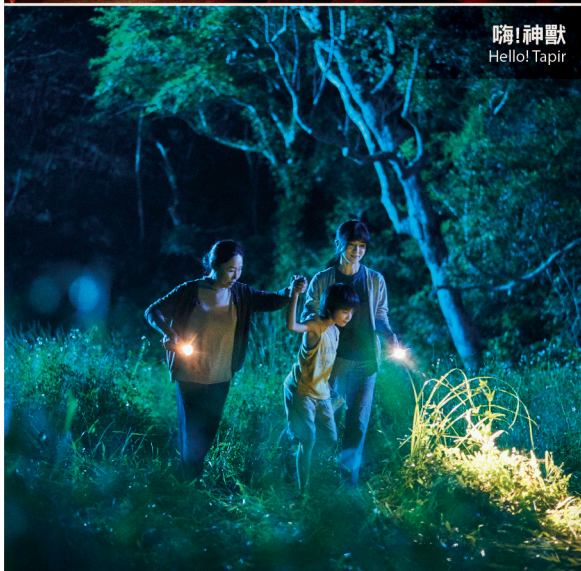
嗨!神獸 Hello! Tapir