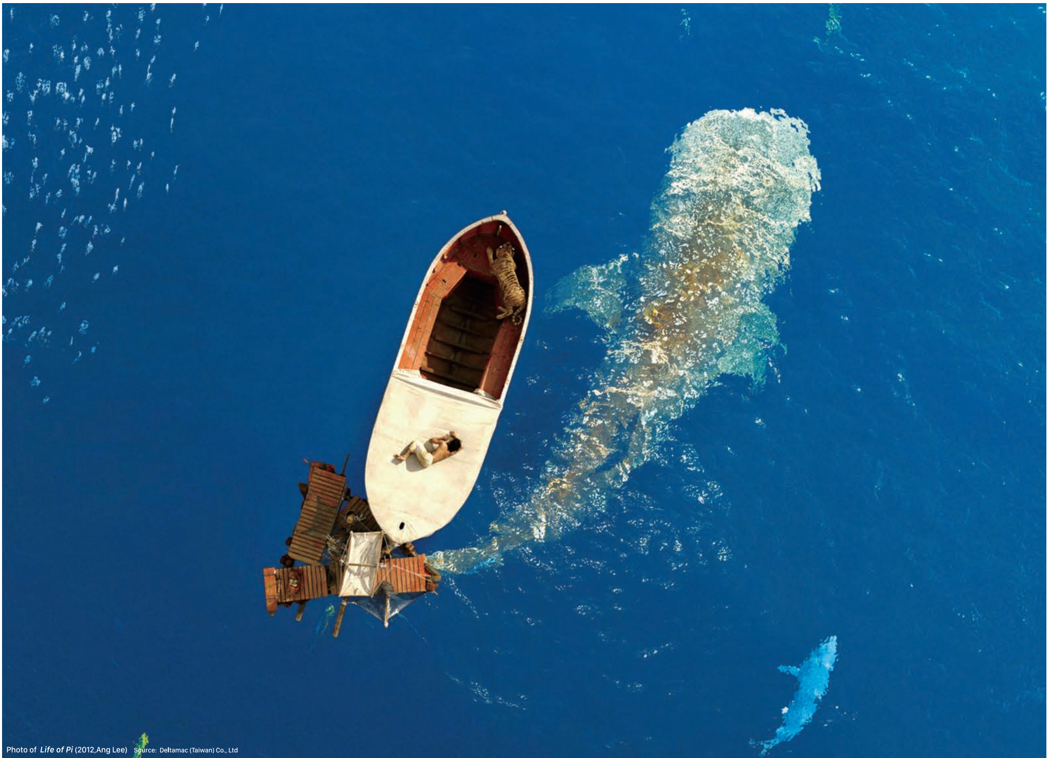
Photo of Life of Pi (2012, Ang Lee)