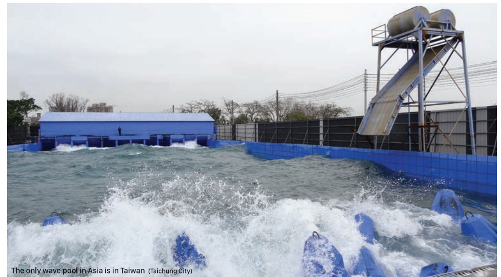
The only wave pool in Asia is in Taiwan (Taichung City)