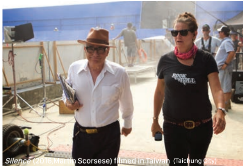
Silence (2016, Martin Scorsese) filmed in Taiwan (Taichung City)