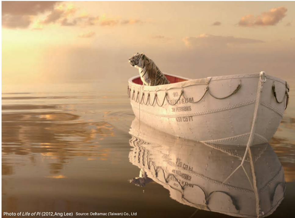
Photo of Life of Pi (2012, Ang Lee)