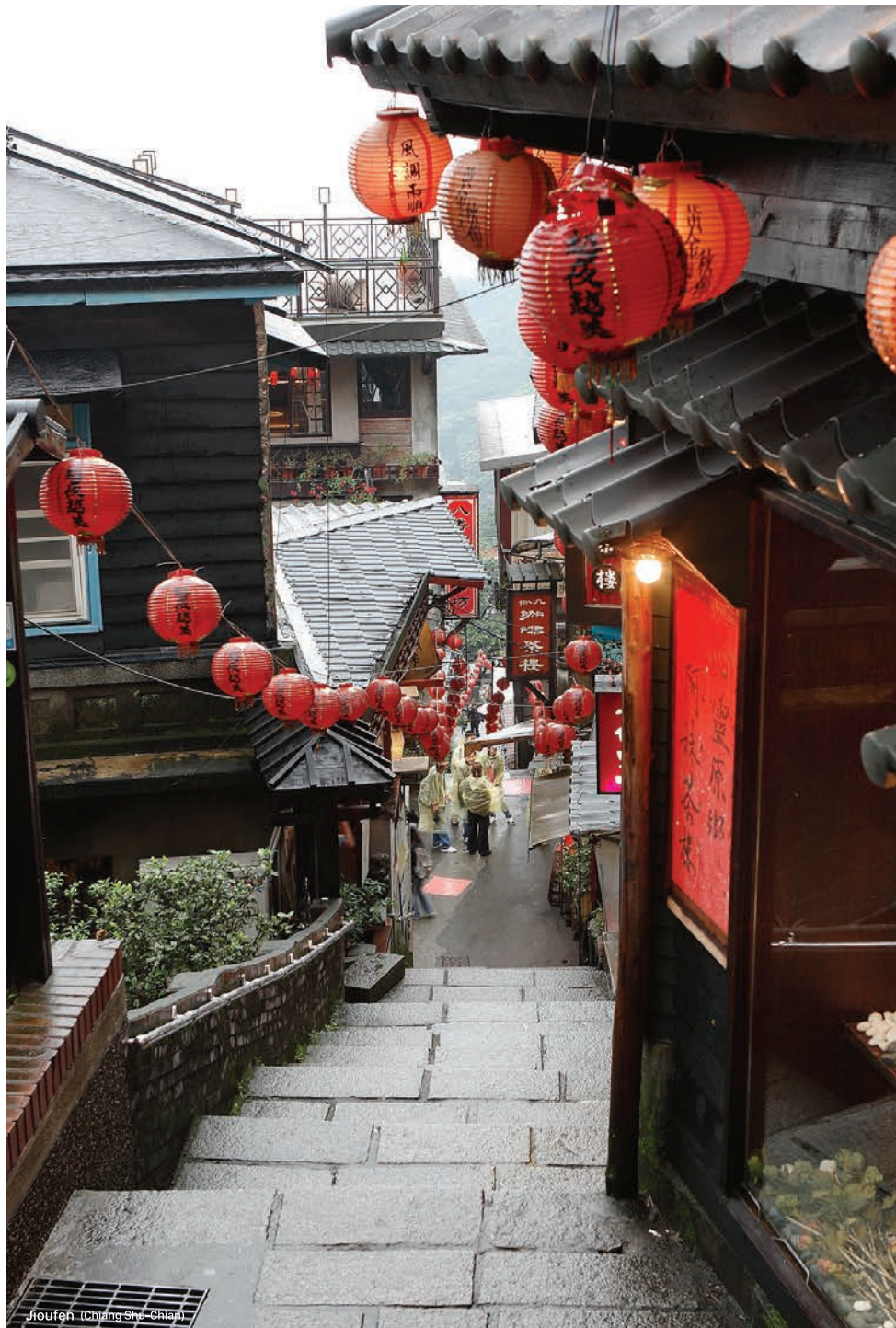
Jiufen (Chiang Shih-Chang)