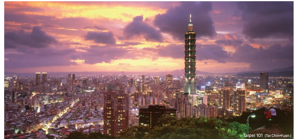
Taipei 101 (Tai Chin-Yuan)