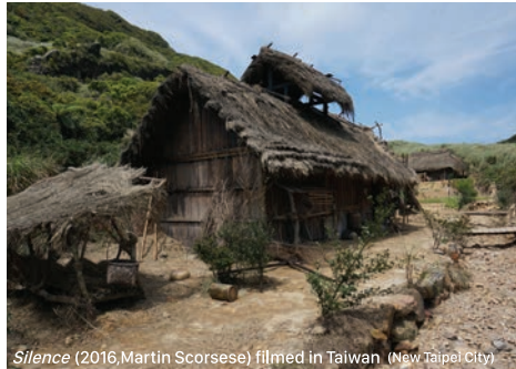
Silence (2016, Martin Scorsese) filmed in Taiwan (New Taipei City)