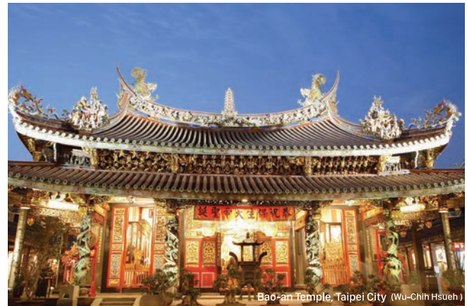
Bao-an Temple, Taipei City (Wu-Chih Hsueh)