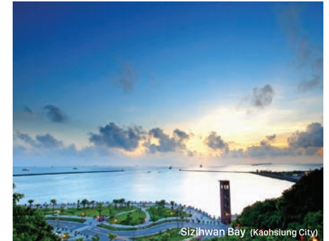
Sizihwan Bay (Kaohsiung City)